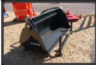
ANSUNG 4 - in - 1 Buckets SKID STEER OR EURO QUICK ATTACH MUST ADD COUPLERS & HOSES 24" DEPTH; 3 RD SERVICE VALVE AVAILABLE