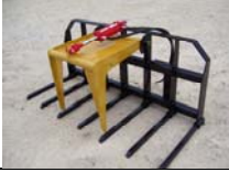
UTILITY GRAPPLE FORK QUICK ATTACH OR PIN ON