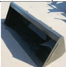
ANSUNG Buckets SKID STEER QUICK ATTACH BLACK OR ORANGE