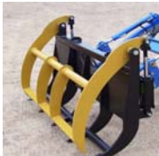
BRUSH GRAPPLE RAKE QUICK ATTACH OR PIN ON